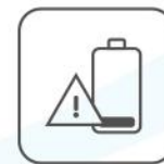
Low Battery Warning