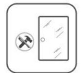
No Hole Drilling Required