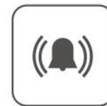
Door Bell Ring