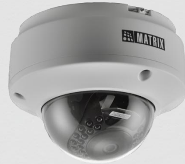
SATATYA CIDR30MVL12CWP 3MP IR Dome Camera with 2.8-12mm Lens

Matrix Project Series IP Cameras are built using superior components such as Sony STARVIS sensor and higher MTF lens to offer unmatched image quality especially during the low light conditions. Powered by True WDR algorithm, these cameras offer consistent image quality even in highly varying lighting conditions. Built in intelligent analytics including Intrusion Detection, Trip Wire, etc. ensure real-time security. Moreover, H.265 compression and Automatic Motion based Frame Rate Reduction save bandwidth and storage up to 50%.