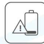
Low Battery Warning