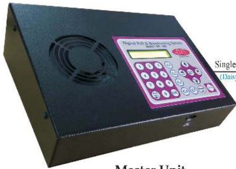
Master Unit (Principal/Admin/Directors Unit)

Only Single Cable is laid. No need to lay 50 cables for 50 rooms or 80 cables for 80 rooms.