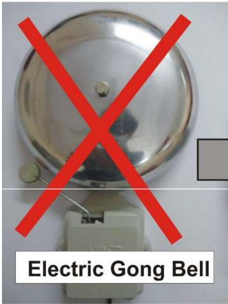
Electric Gong Bell

REPLACE YOUR ELECTRICAL GONG BELL WITH ELECTRONICS GONG BELL